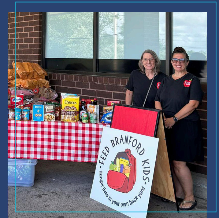
Photos: Volunteers at Community Dining Room (left); Representatives of Feed Branford Kids (right)