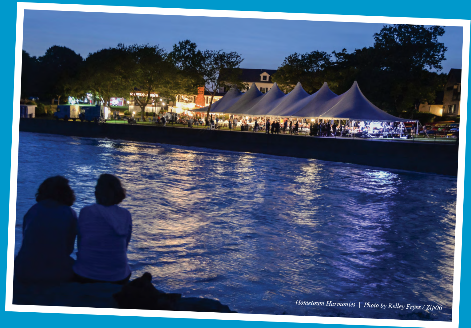
Hometown Harmonies | Photo by Kelley Fryer / Zip06

The amazing show featured a powerful progression of singers, including elementary school students as well as Broadway performers. We were proud to publicly recognize Eunice Lasala, our guest of honor, for her lasting and continuing impact on Branford.